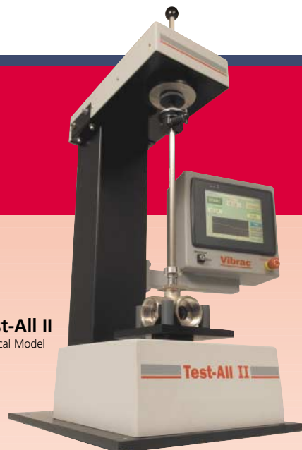
Test-All II Vertical Model

As the industry leader in the precision motion test equipment market, Vibrac continues to develop advanced technology solutions to automate testing problems. Over fifty years of experience in the field of torque measurement has resulted in the development of this patented digital measuring system.