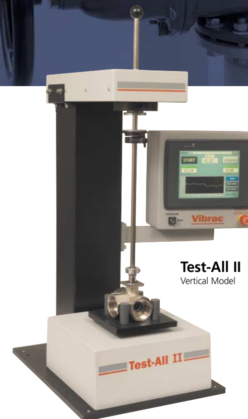
Test-All II Vertical Model