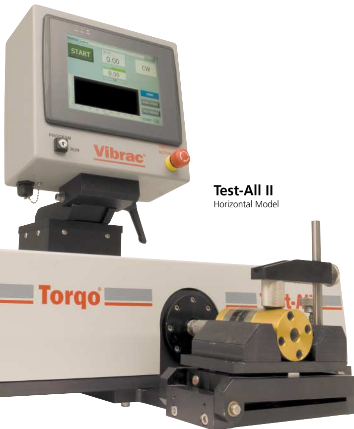
Test-All II Horizontal Model

The horizontal and vertical Test-All II Systems are both an innovative and cost-effective bench-top system for measuring the torque characteristics of rotating devices.